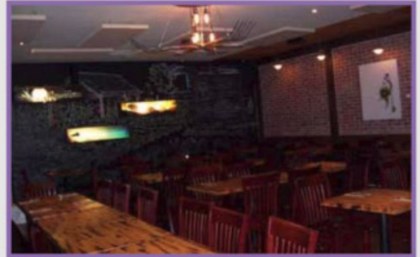
Season 2 'Top Chef Canada' contestant, Trevor Bird's Vancouver restaurant, 'Fable' features exposed brick walls, a creative chalk board wall and an open kitchen concept. With limited wall space to make acoustic improvements, stock beige fabric clouds were hung from the ceiling.