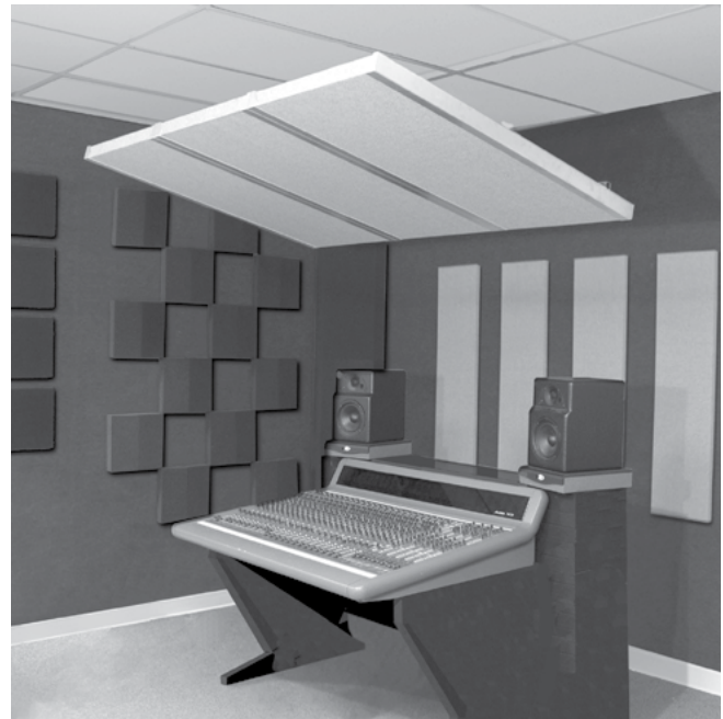
Photo shows three Stratus Cloud Kits above mixing console.