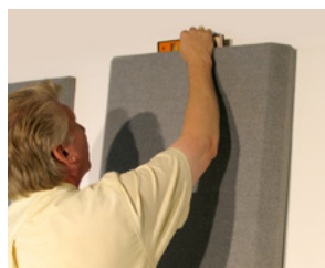
Step 4: Level panel on Set line