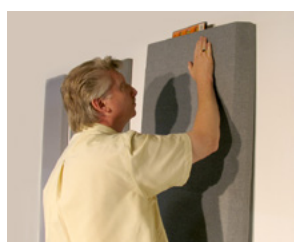
Step 5: Even downward pressure

Congratulations on purchasing Primacoustic Broadway. Broadway is a series of fabric covered, high density, (6 lb per cubic foot) rigid glass wool panels designed to control echo and absorb secondary reflections in any reverberant environment. Because Broadway panels are also Class-1 fire rated, they are ideally suited to provide effective acoustic control in applications as diverse as home-theatre, practice rooms, houses of worship, offices, call centers and broadcast studios.