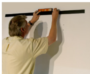
Step 1: Use level to mark top line. Step 2: Repeat for set line.