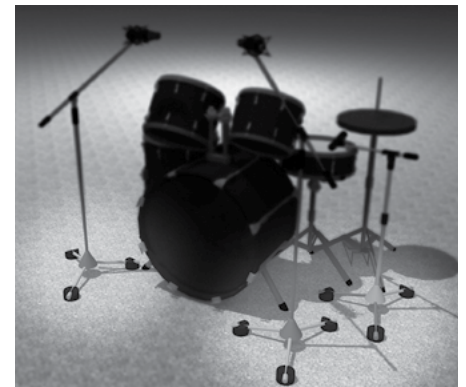
TriPads isolate drum mics from vibrations created by the drums themselves.